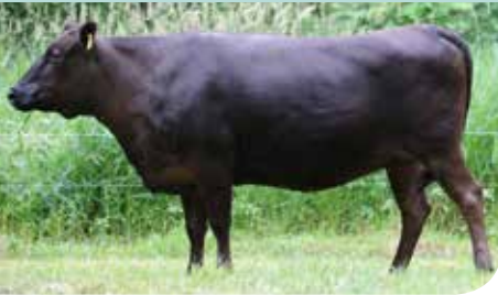
Dam: Ms Mich 109

5 x grade #1 embryos from the mating of BPF Ms Mich, FB8101 (USA) to World K's Haruki II, FB1614 (USA). The Suzutani cow was mated to 3 different bulls (Michifuku, Takazakura, and Haruki II) producing three exceptional sires (Sanjiro, Shigesigetani, and Shikikan). These embryos combine those original 3 bulls that were mated to Suzutani. The pedigree for these embryos is amazing: Haruki II x Michifuku x Takazakura x Suzutani. This mating will provide growth to enhance the breed leading marbling of Suzutani.