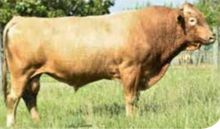
Terminator at 11 years old