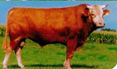
Top: Tamamaru; bottom: Hikari 830