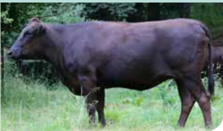
Dam: Stonyrun Shig Hikokura 15

5 x embryos from Stonyrun Shig Hikokura 15 (FB18908) x World K's Michifuku. Hikokura 15 comes from the most elite maternal line of Takeda breeding - the Hikokuras.