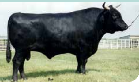
TF Itomichi 1/2

Itomichi 1/2 has been used to increased mature size and growth rate without reducing marbling. TOP 10% Mature Weight, TOP 1 % Milk & TOP 10% Carcass Weight.