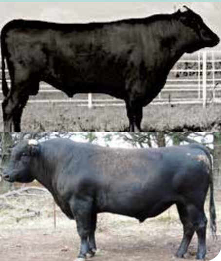
Top: Itoshigenami TF 148 / BA 130891 Bottom: BA13-0891