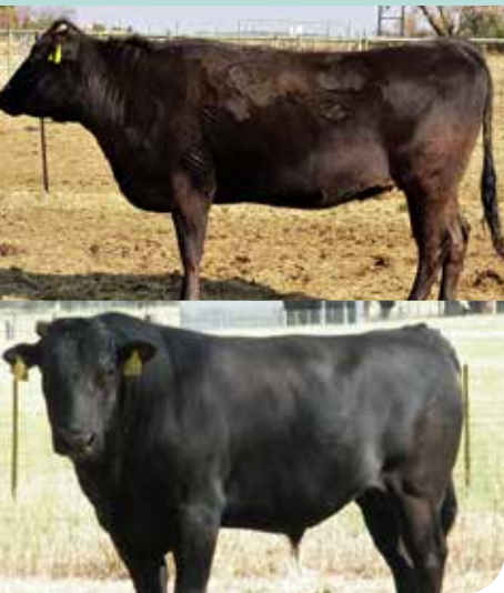
Top: Dam Woodview BA13-0952