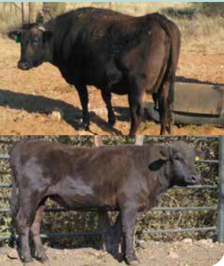
Top: Dam BA13-996 Bottom: Sire PK14-005