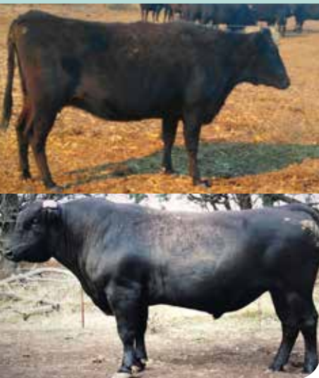
Top: Dam HJ 130013 Bottom: Sire Woodview 13-0891