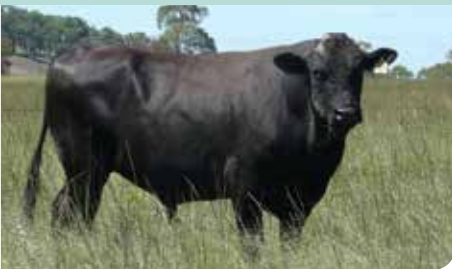
Westholme Hirashigerauasu Z278