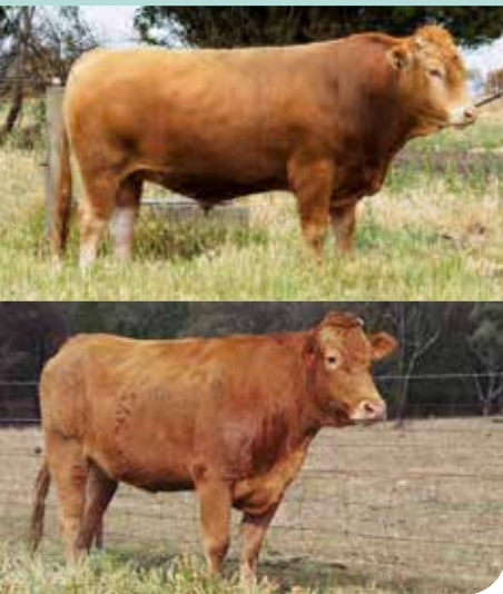
Top: Henshin; bottom: Empress Akkiko

Sire Henshin is large framed, easy going and one of the best bulls among his contemporaries with exceptional EDP's; lots of growth and great breedplan figures. He is in the top 5% of the Australian breed plan for 200 and 600 day weight and top 10% for the 400 day weight. His bloodlines (that trace back to Kaijikari, Hikari and Big Al) are packed with the breeds best red genetics. Dam, Empress Akkiko, is a well-structured female; very correct and one of the biggest framed cows in the Bald Ridge Wagyu program.