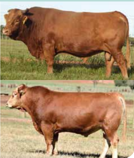
Top: Big Al; bottom: Raymond Reddington